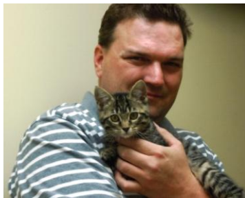
Jason, the kitten, found his home while at Petco adoptions!