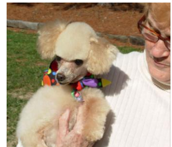
Lucky- groomed and looking cute with his new "mom"