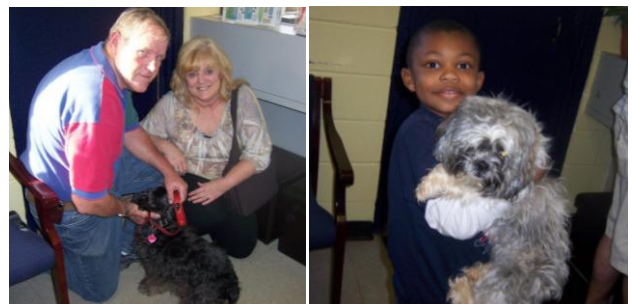
Lost... now found! The HSFC helped reunite these families.