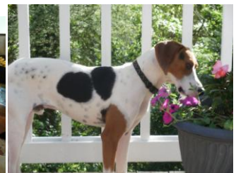
"Annie" (left) and "Beauregard" are loving life with their new families!