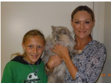
Marmalade is happy in her new home with her three 4 leg sisters and four 2 leg sisters.