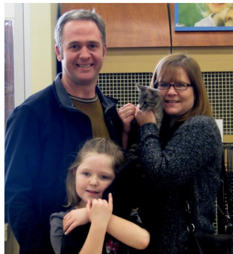
Onyx and Aubie got adopted at Petco!