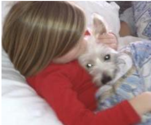
BB loves to snuggle in his new home!